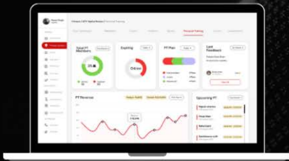
Gym ERP System